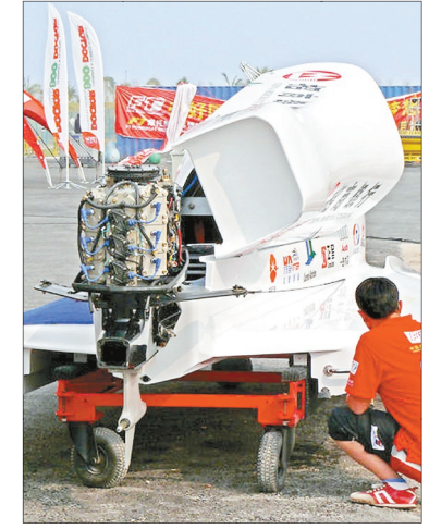
The 400 HP motor in a F1 boat being prepared for the Shenzhen Grand Prix.

of water behind the boats when the driver pushes the accelerator to the floor and all 400 horsepower pushes the boat against the water and air, up to 200 km/h in 3 or